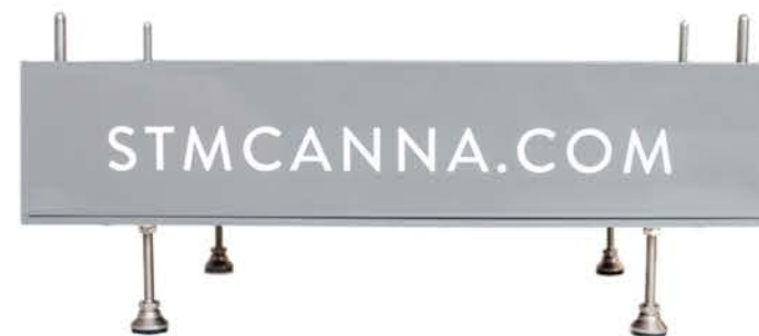
Mini Loading Box