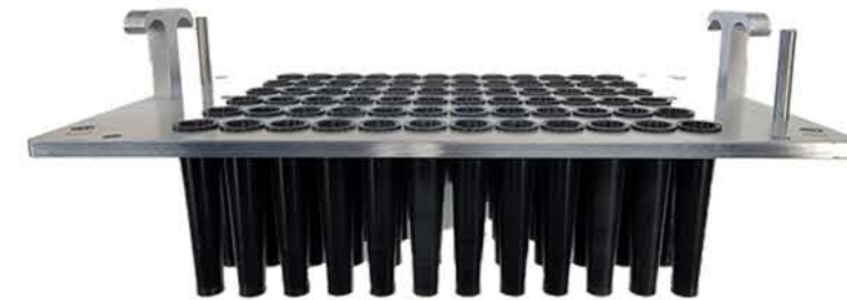
72-Joint Bottom Tray