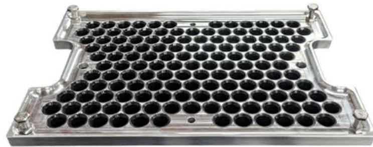
143-Joint Top Tray