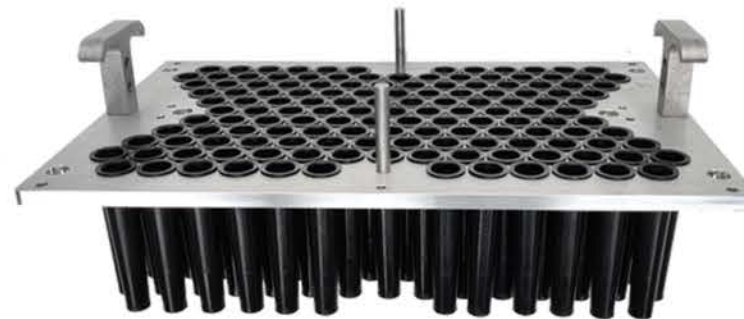
143-Joint Bottom Tray

Compatible With Atomic Closer See Page 7 for Paper Sizing