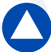
BLUE/UP SYMBOL Underweight

NOTE: When the filled bottom tray is resting on the load cell pad, it is normal for the pre-rolls in the tray to sit at various heights, as the scales under the pad are purposefully staggered.