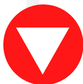
RED/DOWN SYMBOL Overweight